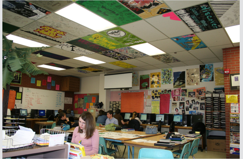
The CMR journalism students work on newspaper and yearbook in the colorful, busy atmosphere in room 326.

Students in all classes learn writing skills, design techniques, organization and time management, advertising sales and design, editing skills, teamwork and communication.